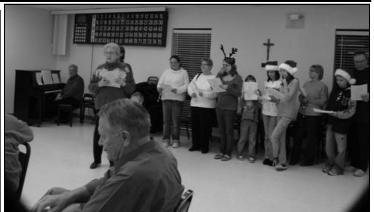
The St. Stephen Men’s Club got a special treat during their December gathering: church members serenaded the group with Christmas carols.